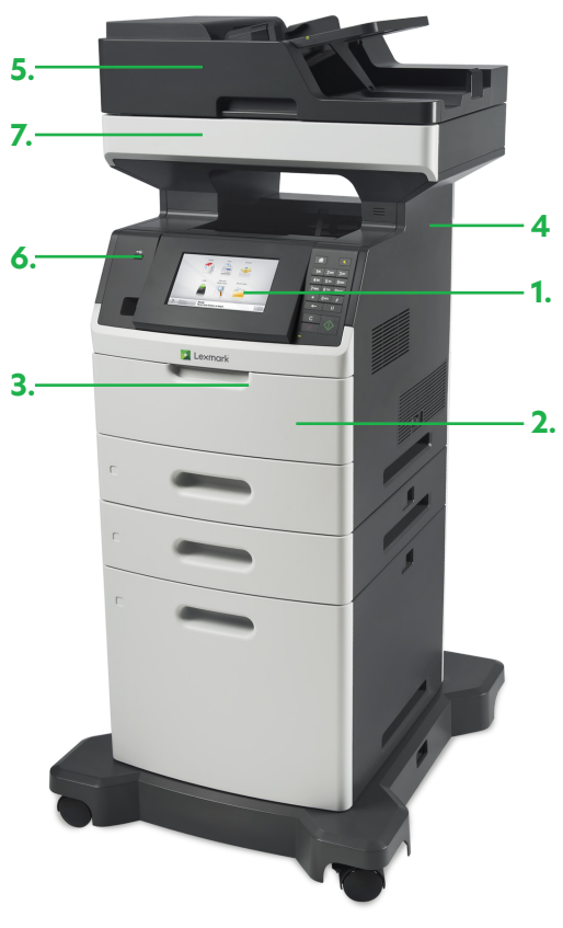
XM5163 model with 550-sheet tray, 2100 sheet tray and caster base