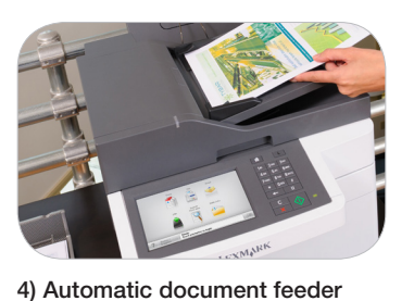
Save time by scanning both sides of your document with robust color-scanning capabilities.