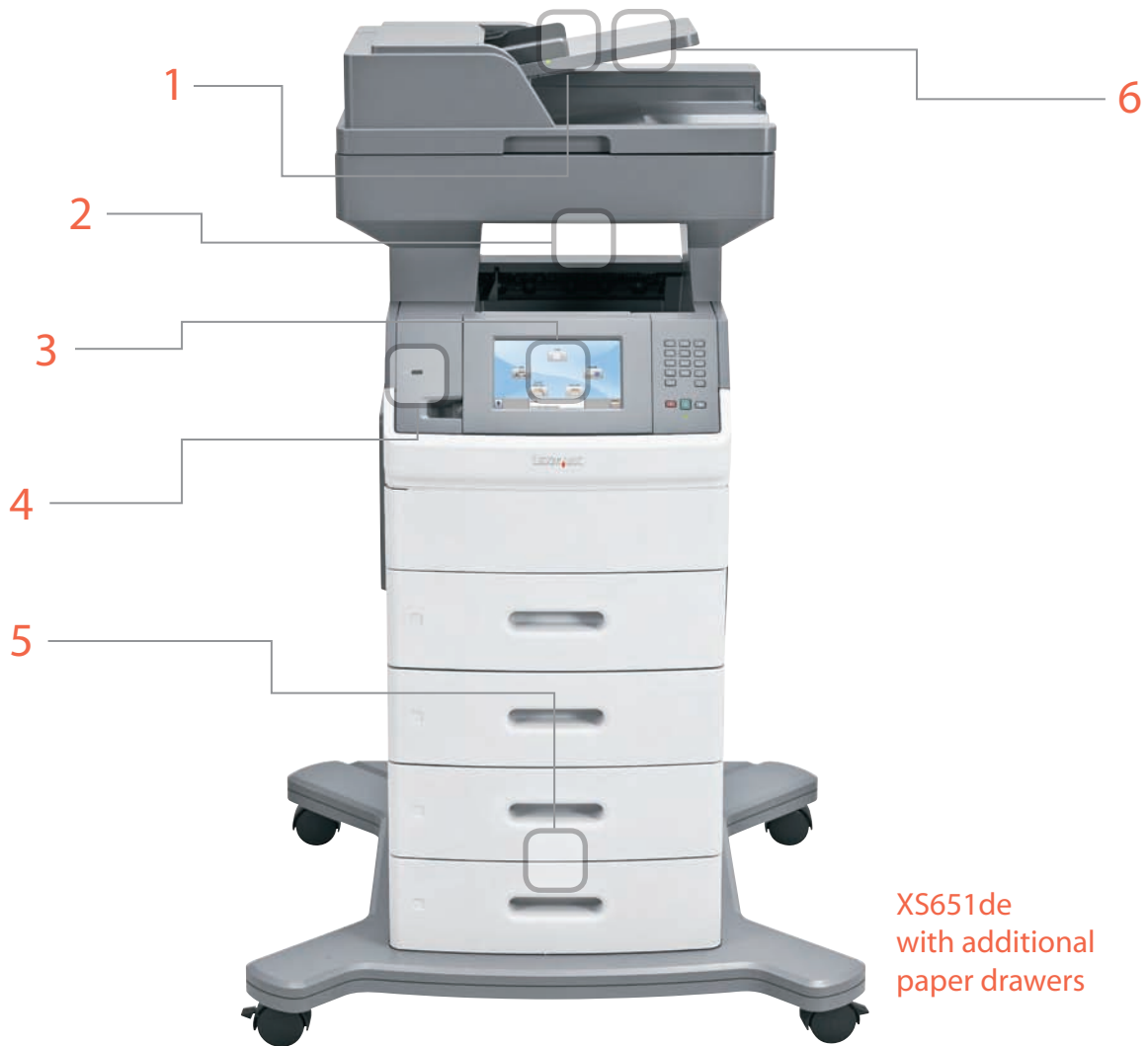
XS651de with additional paper drawers