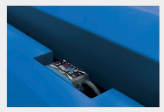
Sensors measure media thickness while print heads automatically adjust.

In addition, laminated packaging better protects its contents from outside elements, such as light and moisture, while preserving key qualities, such as freshness and aroma.