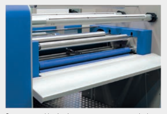
Sensors control lamination temperature to ensure the best results.