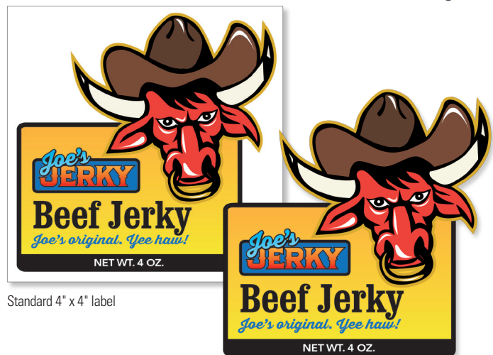
Standard 4" x 4" label