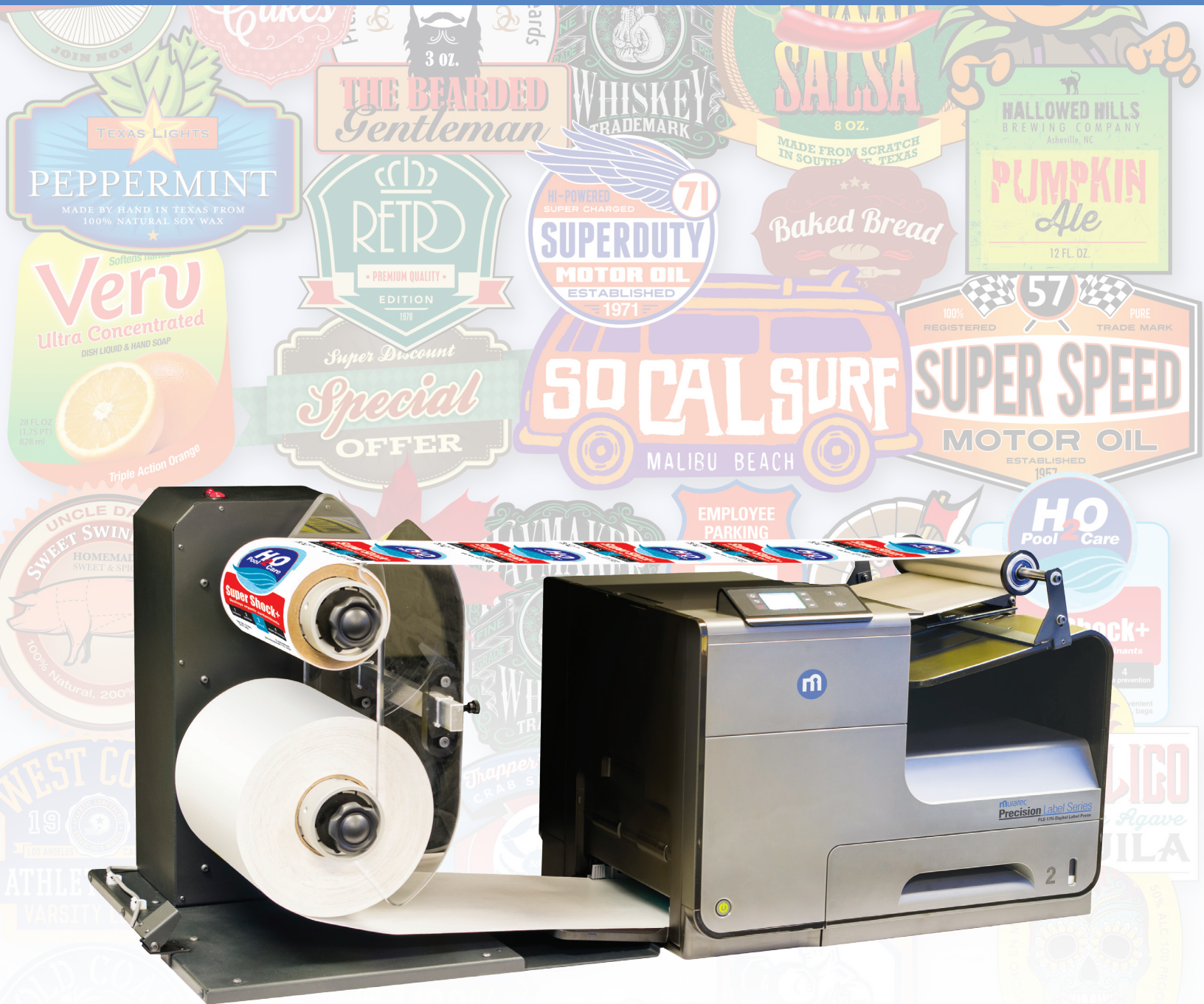
PLS-175i Digital Label Press