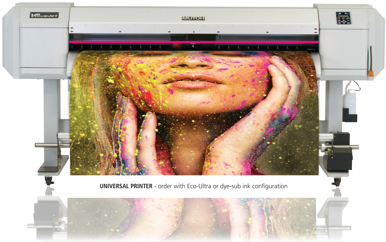
UNIVERSAL PRINTER - order with Eco-Ultra or dye-sub ink configuration