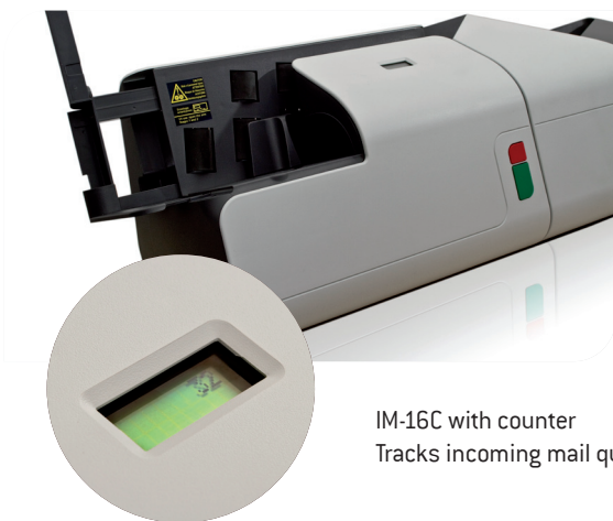
IM-16C with counter Tracks incoming mail quantities

With its innovative opening method, the IM-16 eliminates waste, leaving no messy scraps of paper littered around the office. Its compact size means you can use it where desk space is limited, and also makes it easy to move and store.