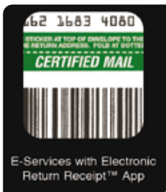
E-Services with Electronic Return Receipt™ App

The Neopost MAS App delivers the detailed reports you need to track, analyze, allocate, forecast, and consolidate your mail processing activity. Automatic alerts and the ability to set budget limits help you monitor costs and control overspending. Viewing and reporting can be done for a single location or an integrated multi-site enterprise.