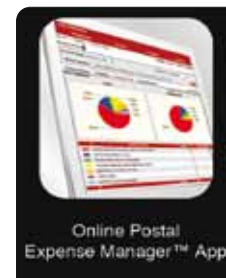
Online Postal Expense Manager™ App

Compact, extendable catch tray accommodates #10 to 10" x 13" envelopes