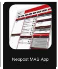
Neopost MAS App