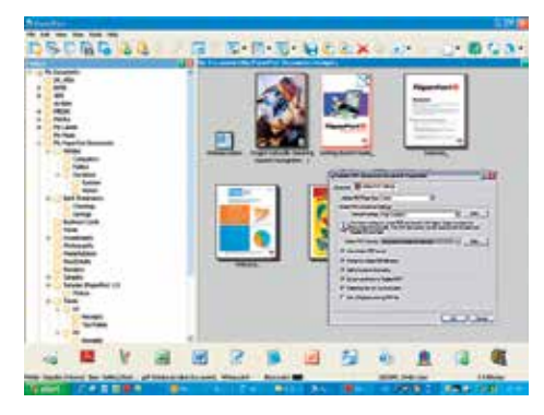
Nuance's PaperPort is an award-winning scanning and document management application that turns paper into digital content.

The feature-rich OmniPage converts scanned documents and PDF files into editable file formats used by applications such as Microsoft<sup>®</sup> Word, Excel®, Adobe® Acrobat® or HTML files.