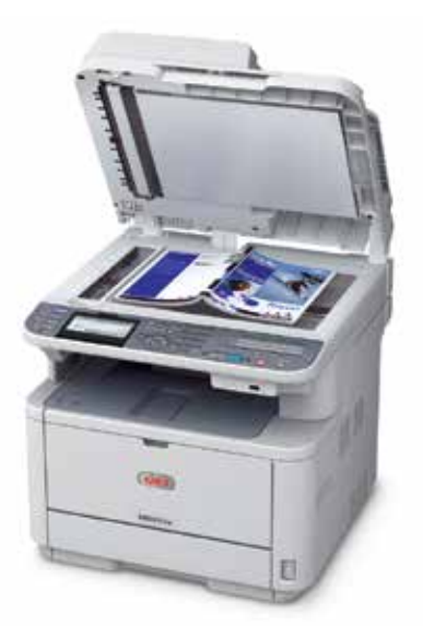
The MB451w MFP features a flatbed scanner, as well as a 50-sheet reversing duplex automatic document feeder (RADF).