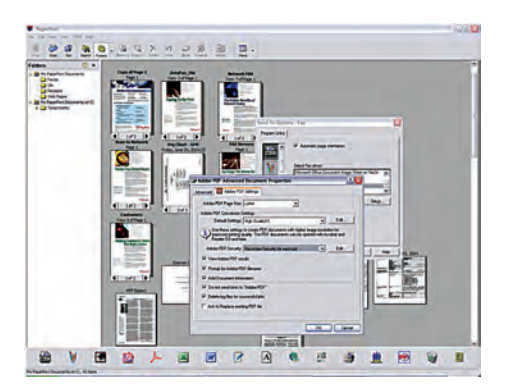
PaperPort is an award-winning scanning and document management application that turns paper into digital content.

Document management is a snap – Among the utilities that come standard with the MC160 Color MFP is PaperPort® by Nuance®. This award-winning scanning and document management application turns paper into digital content. With its intuitive, thumbnail-based interface, PaperPort lets you take any scanned document, save it in a PDF format, and quickly make it available for archiving or sharing.