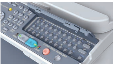
Full QWERTY keyboard (behind lift-open 1-Touch key panel): enables easy entry of email addresses and messages

Easy-to-read and -use operator panel: ergonomically designed to meet the needs of your workflow environmentkeeping tasks simple and end users more productive. Backlit LCD display tilts up to enhance user productivity.