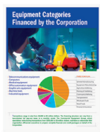
HD Color Printing

An important feature of Print Job Accounting is the use of color printing restrictions. This lets you control and monitor color usage by defining who can print and what gets printed, making color printing cost-effective. Decide who and what can print in color, in black & white or not at all. Access levels can be assigned by user name, application, file name and web sites. Once policies are configured, the printer determines how—or if—incoming jobs will print. All policies are password-protected for added security.