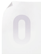
No printout permitted