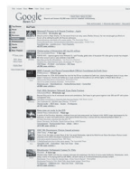
Crisp, clear Black & White