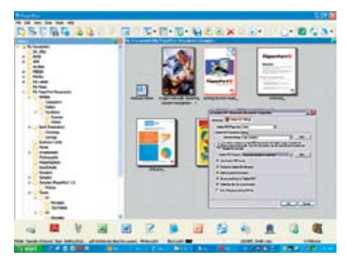
Nuance's PaperPort is an award-winning scanning and document management application that turns paper into digital content.

The feature-rich OmniPage converts scanned documents and PDF files into editable file formats used by applications such as Microsoft<sup>®</sup> Word, Excel<sup>®</sup>, Adobe<sup>®</sup> Acrobat<sup>®</sup> or HTML files.