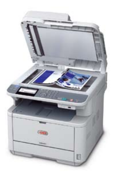
All four models in the MB401 MFP Series feature a flatbed scanner, as well as a 50-sheet reversing automatic document feeder (RADF).