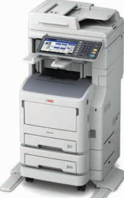
MB770f+ - Up to 55 ppm; 1,160-sheet standard paper capacity, upgradable to 1,690 sheets; 50-sheet in-line stapler