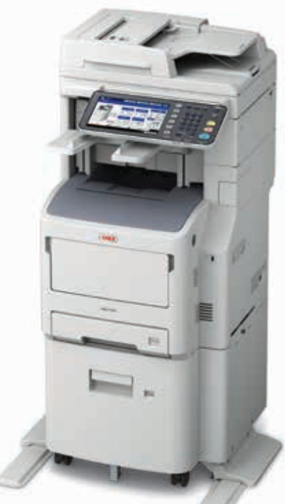
MB770fx+ – Up to 55 ppm; 2,630-sheet standard paper capacity, upgradable to 3,160 sheets with optional 530-sheet 2nd paper tray; 50-sheet in-line stapler