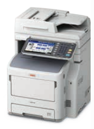
MB770+ – Up to 55 ppm; 630-sheet standard paper capacity, upgradable to 3,160 sheets; 20-sheet convenience stapler