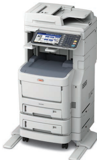
MC780f – Up to 42 ppm Color/Mono; 1,160-sheet standard paper capacity, upgradable to 1,690 sheets; 50-sheet in-line stapler