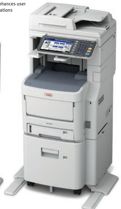
MC780fx – Up to 42 ppm Color/Mono; 2,630-sheet standard paper capacity, upgradable to 3,160 sheets; 50-sheet in-line stapler