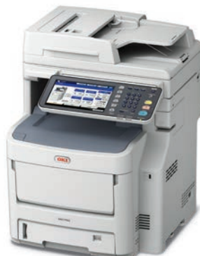
MC780 – Up to 42 ppm Color/Mono; 630-sheet standard paper capacity, upgradable to 3,160 sheets; 20-sheet convenience stapler