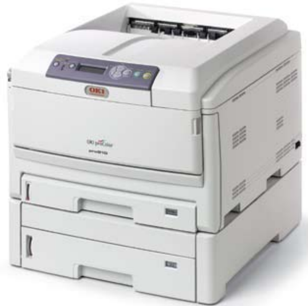
The pro810dtn: shown with standard 530-sheet 2nd paper tray (optional on other models).

The pro810 Series of OKI proColor printers. Compact in size yet big on quality and media flexibility, these affordable color printers provide the performance that you've come to expect from Oki Data Americas, Inc.