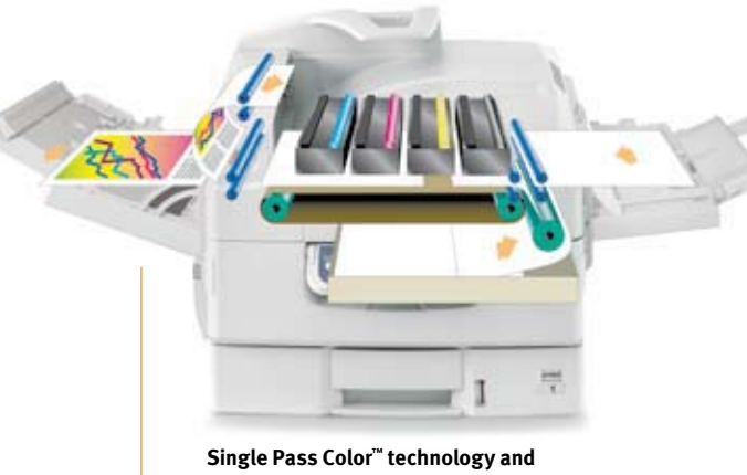
Single Pass Color™ technology and straight-through paper path handle thick paper stock and banner sheets.

The OKI proColor Series pro930 from Oki Data Americas, Inc.: high quality and low operational costs—the right Digital Color Printer for your color-sensitive, short-run print projects.