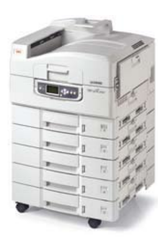
The pro930 printer holds up to 2,880 sheets, with options.