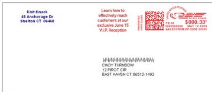
Custom Messaging . Envelope Advertising . Digital Printing

Sharp digital printing – The inkjet printing process creates crisp, razor-sharp images.