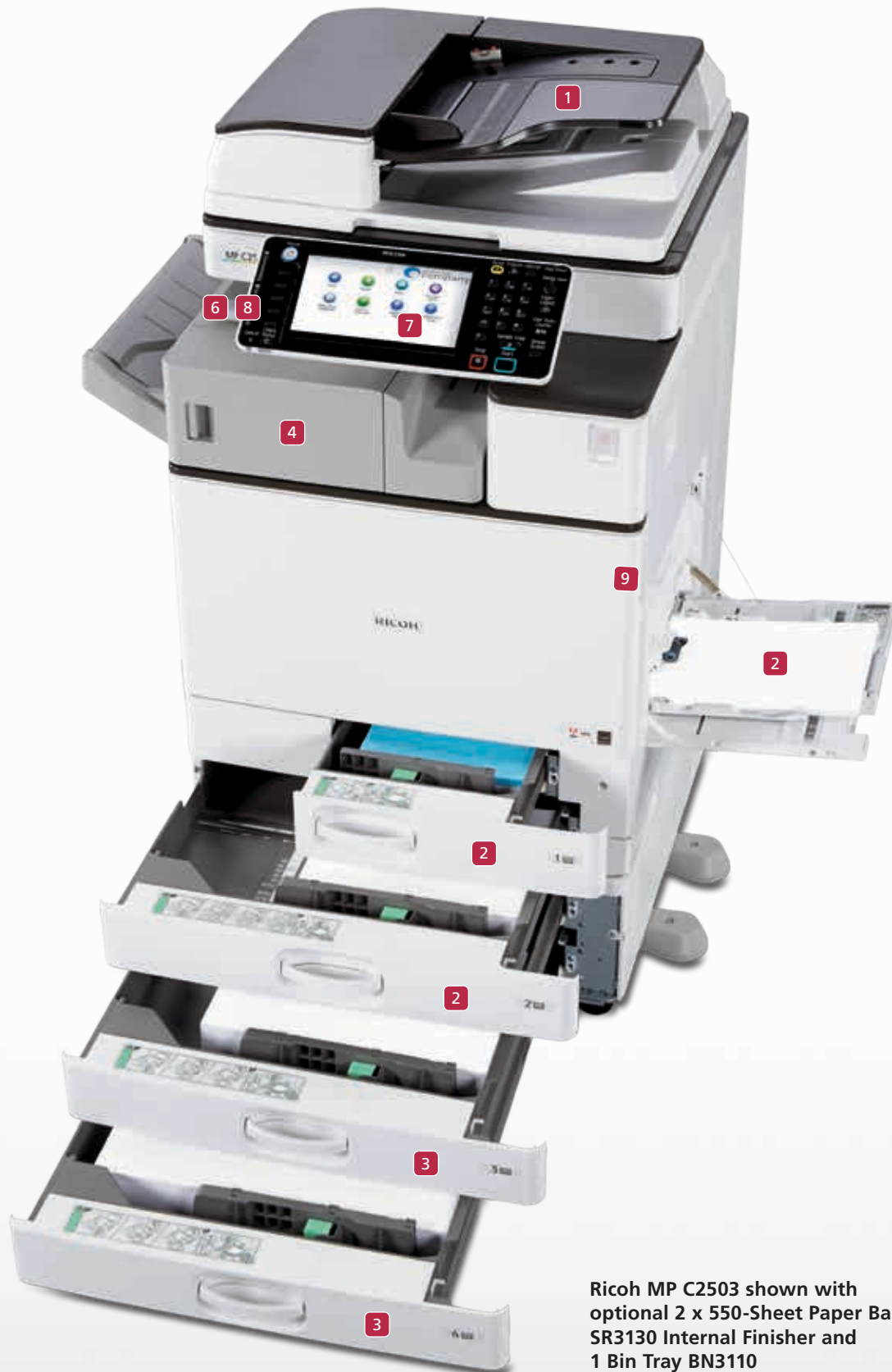
Ricoh MP C2503 shown with optional 2 x 550-Sheet Paper Bank, SR3130 Internal Finisher and 1 Bin Tray BN3110