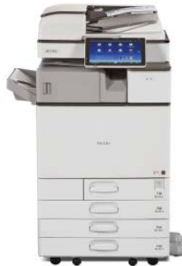
SR3220 External Booklet Finisher