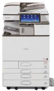
SR3130 Internal Finisher