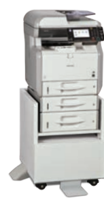
Standard Tray with one 250 and one 500 Sheet Tray