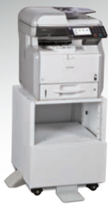
Standard 500 Sheet Tray