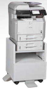
Standard Tray with one 500 Sheet Tray