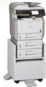
Standard Tray with two 500 Sheet Trays