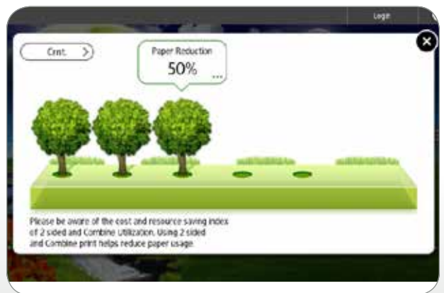
Eco-Friendly Indicator Screen as shown on the Smart Operation Panel.

You'll find just the opposite to be true with the Ricoh MP 4054/MP 5054/MP 6054. It offers low cost-per-page and best-in-class typical electricity consumption (TEC) values so you can reduce costs while meeting your sustainability goals. With a shorter recovery time of less than 5 seconds from sleep mode, the Ricoh MP 4054/MP 5054/MP 6054 keeps up with today's fast-paced business environment. You can program the device to power on or off during specified times to conserve energy for even greater savings. Plus, the device meets EPEAT® Gold* criteria — a global environmental rating system for electronic products — and is certified with the latest ENERGY STAR™ specifications.