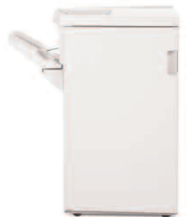
SR4050 3,000-Sheet Finisher with 100-Sheet Stapler