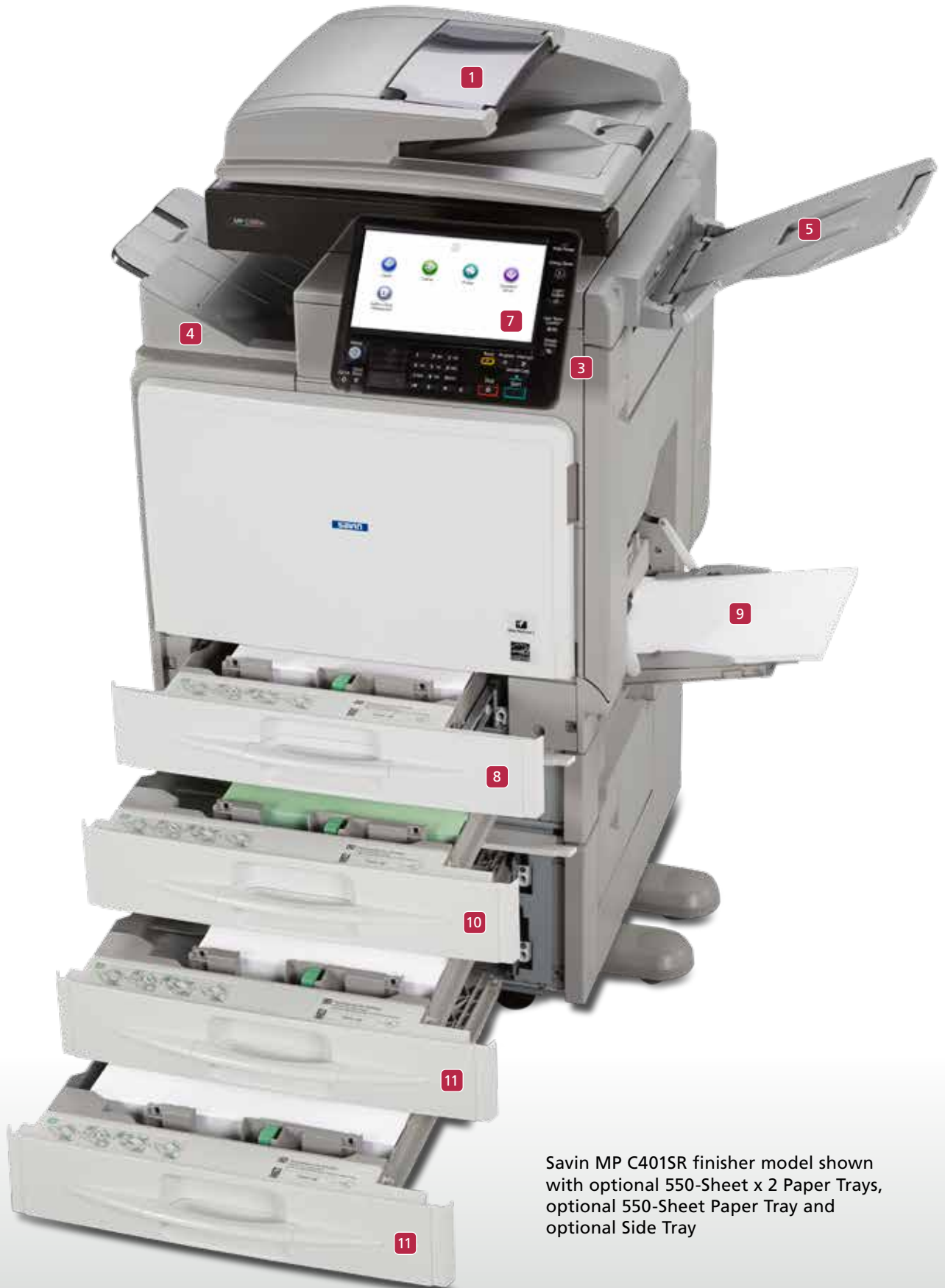
Savin MP C401SR finisher model shown with optional 550-Sheet x 2 Paper Trays, optional 550-Sheet Paper Tray and optional Side Tray