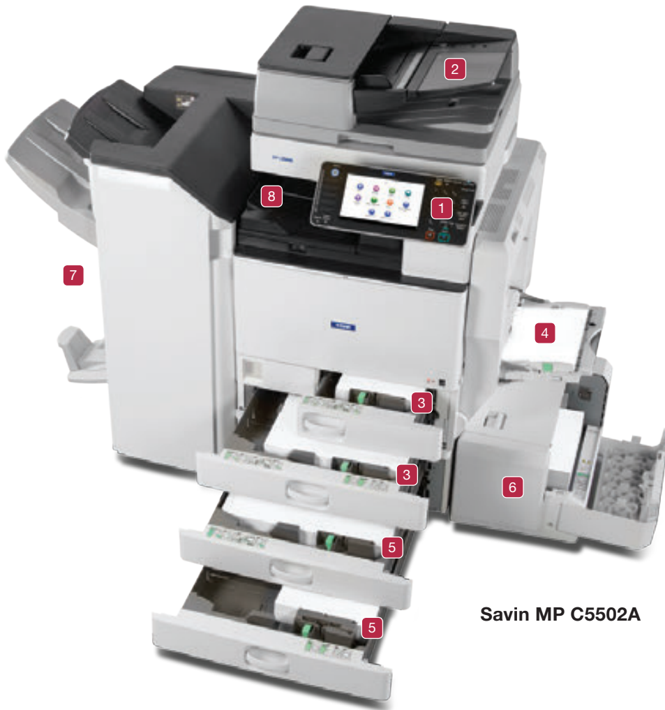
Savin MP C5502A