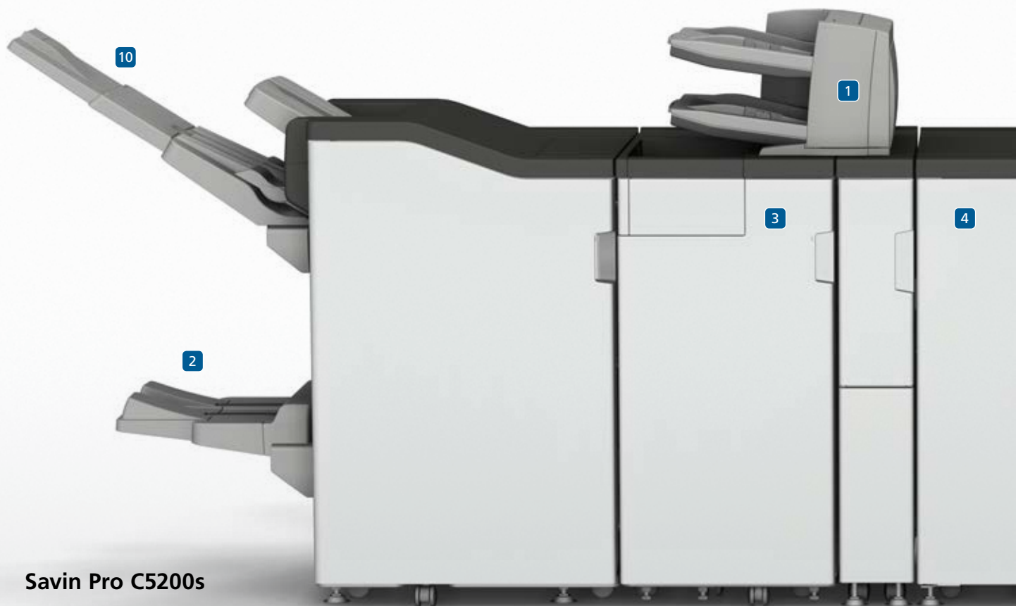
Savin Pro C5200s