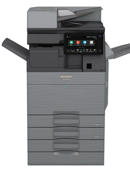
BP-70C65 shown with Inner Folding Unit, Right Side Exit Tray and 2-drawer Paper Deck.

10.1" (diagonally measured) customizable touchscreen display.