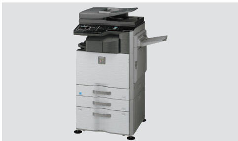
Available paper capacity stores up to a maximum of 3,100 sheets with options