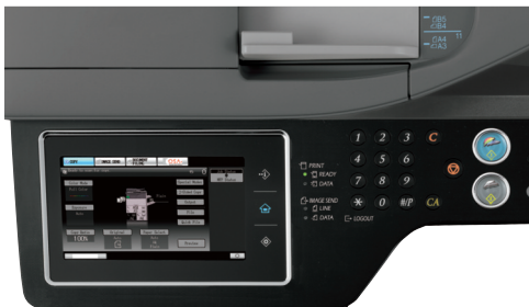
High-resolution touch screen with Stylus pen for easy point-and-touch operation