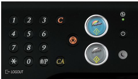
Separate print buttons for B&W and Color allow users to selectively manage use of color

Managing all of the advanced features of your Sharp product is simple and easy. Ask your Authorized Sharp Dealer about the My Sharp website . This dedicated customer training website is customized to your MX-2615N/MX-3115N and allows you to locate resources and find information specific to your configuration, truly helping you maximize your investment.