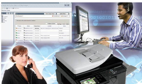
Sharp Remote Device Management