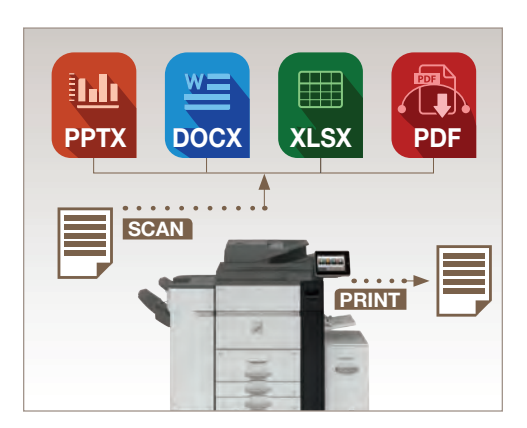
Scan and convert documents to popular file formats seamlessly with built-in OCR function.