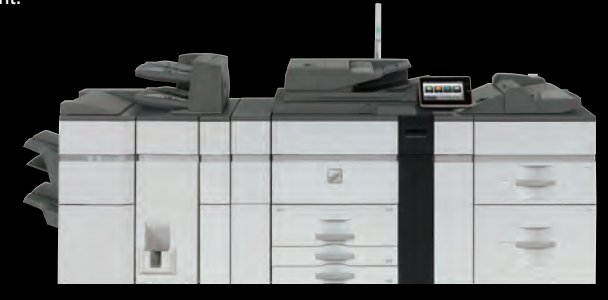
MX-M905 shown with Curl Correction Unit, Inserter, Multi-Folding Unit, 100-sheet Staple Finisher, 5,000-sheet large capacity trays, 500-sheet multi-bypass tray and status indicator.