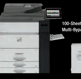
MX-M905 Base Machine