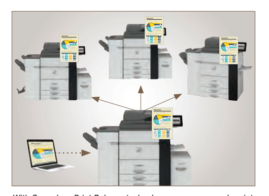
With Serverless Print Release technology you can securely print a job and release it from any of six supported models.