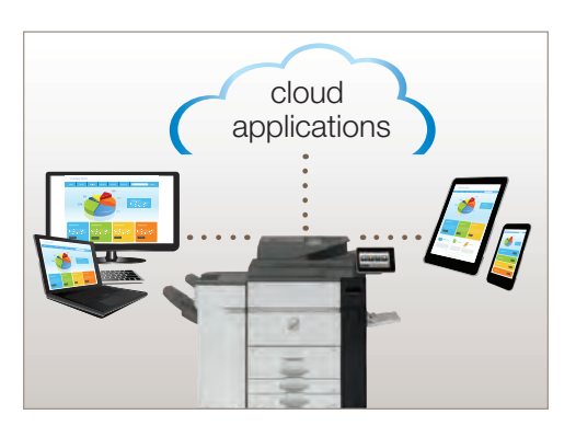
Distribute, access and print documents more easily.