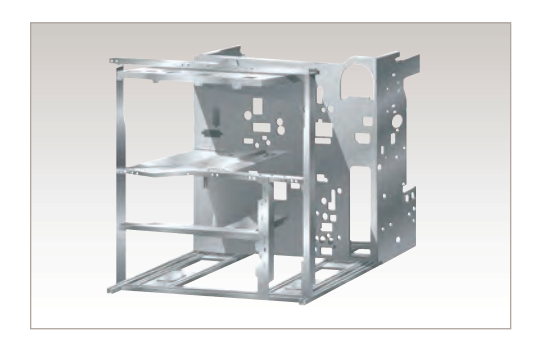
A highly-rigid frame design helps better protect and isolate critical machine components. This also ensures increased reliability and durability in order to withstand heavy use from high-speed and high-volume output.