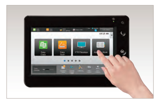
A high-resolution customizable touchscreen helps you navigate smoothly through advanced MFP functions.