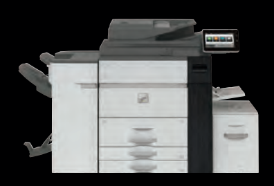
MX-M905 shown with 3,500-sheet large capacity cassette, 50-sheet Staple/Saddle Finisher and 100-sheet bypass tray.

The MX-M905 high-speed monochrome document systems offer flexible paper handling and finishing options to accommodate virtually any environment. *