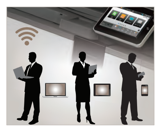
Built-in wireless network interface offers convenient scanning and printing from mobile devices.