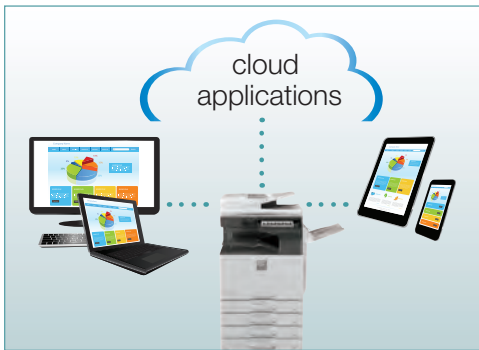
Distribute, access and print documents more easily.