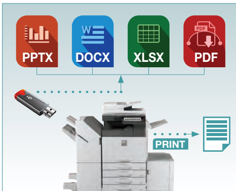
Direct print to popular file formats seamlessly with Sharp's available direct print expansion kit. 1