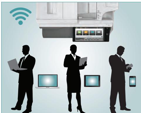
Available wireless network interface for convenient scanning and printing from mobile devices.

From paper handling to networking, the MX-3050V, MX-3550V, and MX-4050V color Essentials Series will exceed your expectations.