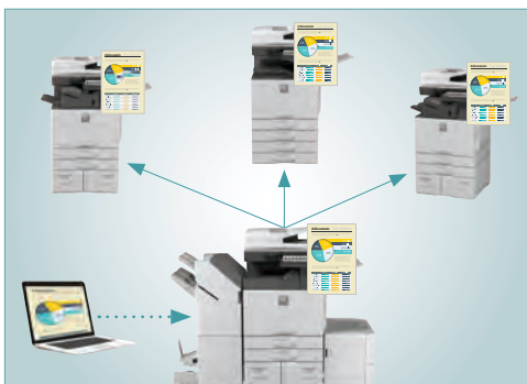
With Serverless Print Release technology you can securely print a job and release it from any of five color Essentials Series models.