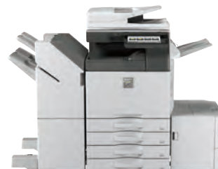
MX-4050V shown with 3K saddle stitch finisher and large capacity cassette.