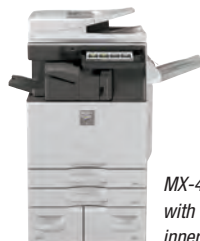
MX-4050V shown with compact inner finisher.

When it’s time to get the job done, the Essentials Series color document systems are outstanding performers. Quickly scan documents at speeds up to 80 images per minute . Then use the manual stapling feature on select finishers to restaple your originals. Multiple finishing options give you the output you require, be it stacked, stapled, or saddle-stitched. There’s even an available built-in stapleless staple feature, which can bind up to five sheets of paper by adding a crimp to the corner of the set, saving regular staples for larger sets.