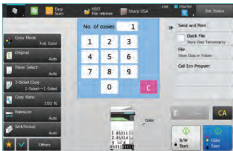
Standard Copy Screen offers more advanced features.