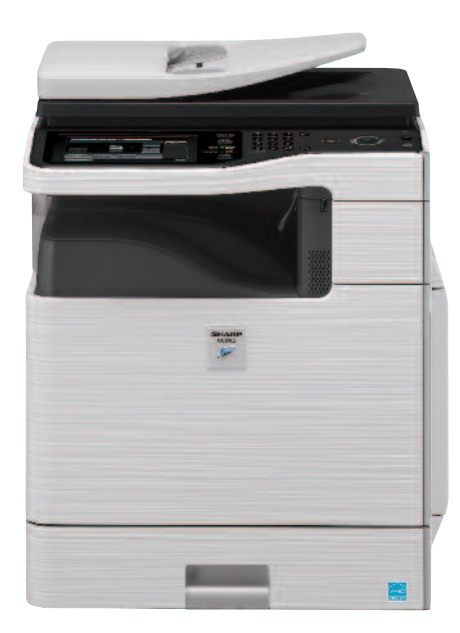
MX-B402 with compact cabinet-top design—anywhere you want it.

Sharp's innovative printing system makes it easy for any business to store and archive print jobs. With the ability to retain jobs on the MX-B402 hard drive, documents can be stored and reprinted again and again by walk-up users or through the embedded web page . Print jobs can even be sent to the MX-B402 for archiving without printing them! Need to store sensitive documents? No problem! Users can assign a password right from the print driver or from the MX-B402 operation panel!