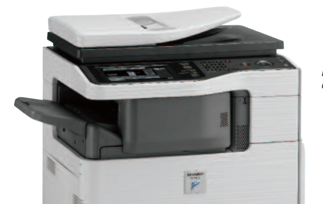
MX-B402 with space-efficient optional Inner Finisher

The optional Inner Finisher can be added without taking up additional floor space. The space efficient finisher not only provides exceptional productivity but also automates time-consuming tasks such as stapling, sorting and offset stacking.