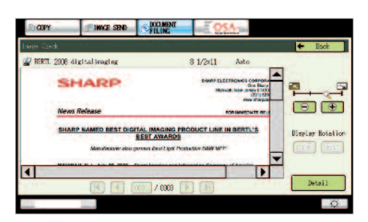
Sharp's Image Check feature allows users to preview stored documents at the device. Easily zoom, rotate and scroll.