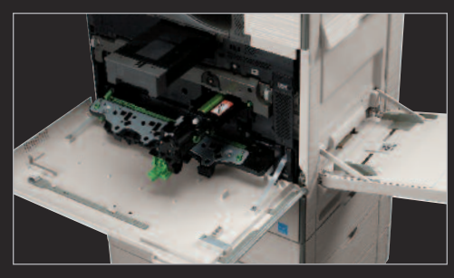
High yield, long life toner cartridge (shown above) and a refillable developer system help reduce copy cost and increase environmental sustainability.