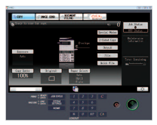
Remote Front Panel