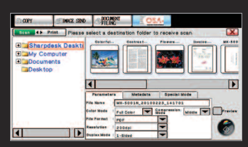
The Sharpdesk Connector for Sharp OSA v 3.5 enabled MFPs enhances scan worklfow options.

Intuitive desktop display features thumbnail viewing and file search allows searching by file name, keyword, or thumbnail.