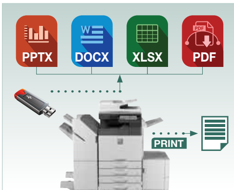
Direct print to popular file formats seamlessly with Sharp's available Direct Print Expansion Kit. 1