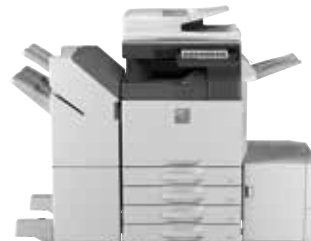
MX-M4050 shown with 3K saddle stitch finisher and large capacity cassette.