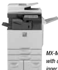
MX-M4050 shown with compact inner finisher.

When it’s time to get the job done, the Essentials Series monochrome document systems are outstanding performers. Quickly scan documents at speeds up to 80 images per minute . Then use the manual stapling feature on select finishers to restaple your originals. Multiple finishing options give you the output you require, be it stacked, stapled or saddle-stitched. There’s even an available built-in stapleless staple feature, which can bind up to five sheets of paper by adding a crimp to the corner of the set, saving regular staples for larger sets.