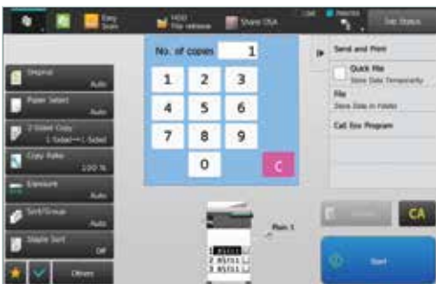
Standard Copy Screen offers more advanced features.