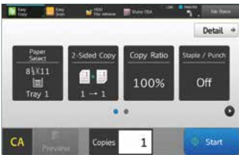
Easy Copy Screen offers the most commonly used settings.