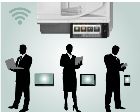
Available wireless network interface for convenient scanning and printing from mobile devices.

From paper handling to networking, the MX-M3050, MX-M3550 and MX-M4050 monochrome Essentials Series will exceed your expectations.