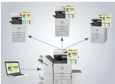
With Serverless Print Release you can securely print a job and release it from up to six Advanced Series models (including host).