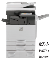
MX-M4070 shown with compact inner finisher.

When it's time to get the job done, the Advanced Series monochrome document systems are outstanding performers. Quickly scan documents at speeds up to 200 images per minute . Built-in optical character recognition (OCR) can convert your scanned documents into text-searchable PDFs or Microsoft Office file formats, simplifying your workflow. Use the manual stapling feature on select finishers to restaple your originals. Multiple finishing options give you the output you require, be it stacked, stapled or saddle-stitched. There's even an available built-in stapleless staple feature, which can bind up to five sheets of paper by adding a crimp to the corner of the set, saving regular staples for larger sets.