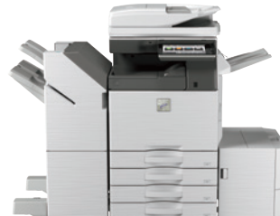
MX-M4070 shown with 3K saddle stitch finisher and large capacity cassette.