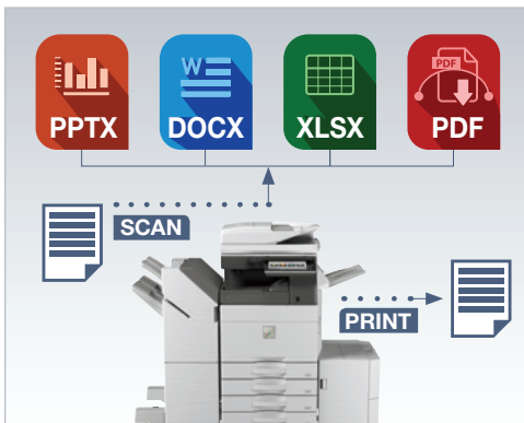
Scan and convert documents to popular file formats seamlessly with Sharp's built-in OCR function.