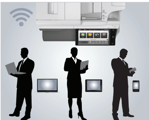
Built-in wireless network interface for convenient scanning and printing from mobile devices.