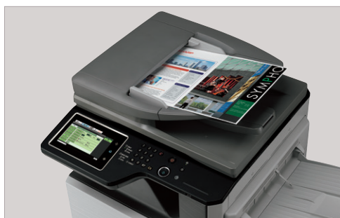
Standard 100-sheet RSPF scans up to 56 images-per-minute.