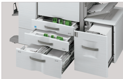
Up to 6,600-sheet paper capacity with available options.