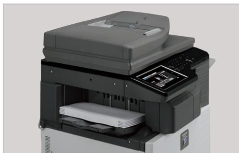
Available compact inner finisher with 50-sheet staple capacity.

A full-featured MFP that is also a strong value – the MX-M364N/M464N/M564N Essentials Series monochrome document systems will exceed your expectations.