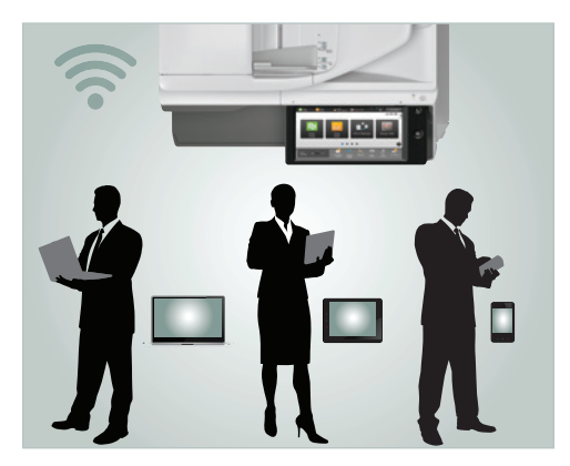
Available wireless network interface for convenient scanning and printing from mobile devices.