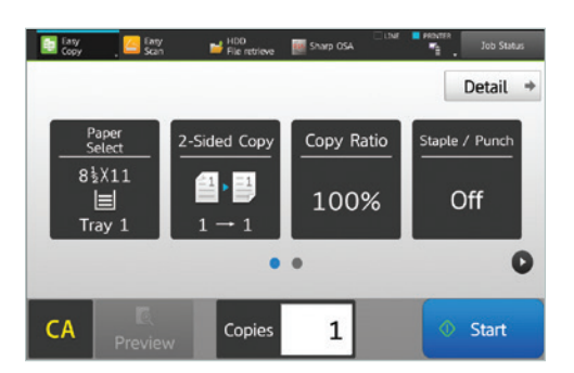
Easy Copy Screen offers the most commonly used settings.