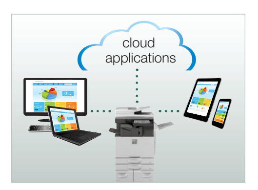
Distribute, access and print documents more easily.