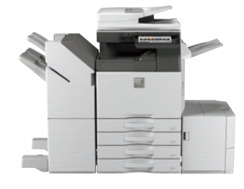
MX-M6050 shown with 3K saddle stitch finisher and large capacity cassette.