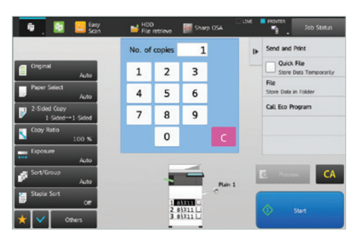
Standard Copy Screen offers more advanced features.