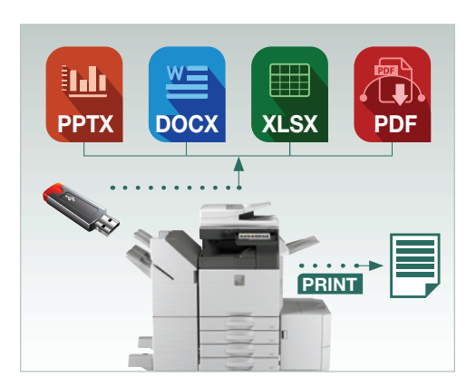
Direct print to popular file formats seamlessly with Sharp's available Direct Print Expansion Kit. <sup>1</sup>