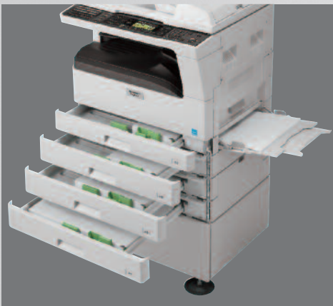
MX-M200D shown with optional 2 x 500-sheet paper feed unit.