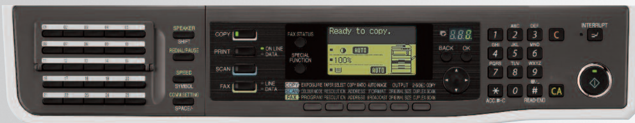
MX-M200D Control Panel with optional Fax Kit.

Maximize capabilities of your MX-M200D with optional full-color network scanning and feature rich network printing! With simple plug-and-play operation, the optional full-featured Network Expansion Kit offers PCL6 network printing, walk-up scanning, web-based device management and more. With Sharp's easy-to-use utilities and driver software, the versatile MX-M200D can easily integrate into an existing network environment.