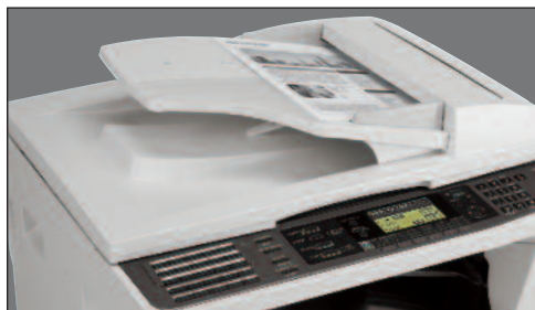
MX-M200D shown with standard 40-sheet Reversing Single Pass Feeder.