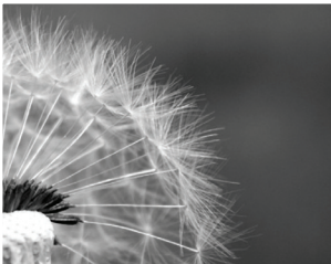
SUPERB IMAGE AND TEXT REPRODUCTION