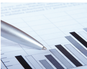
HIGHER PRODUCTIVITY, LOWER RUNNING COSTS