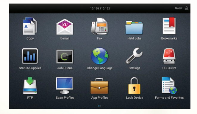
User friendly 7" tablet-style touch screen display.