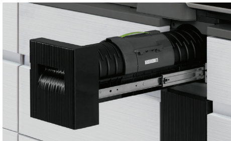
A variety of options allows you to configure an MFP that perfectly suits your needs. All with the speed, reliability, and quality you've come to expect from Toshiba.