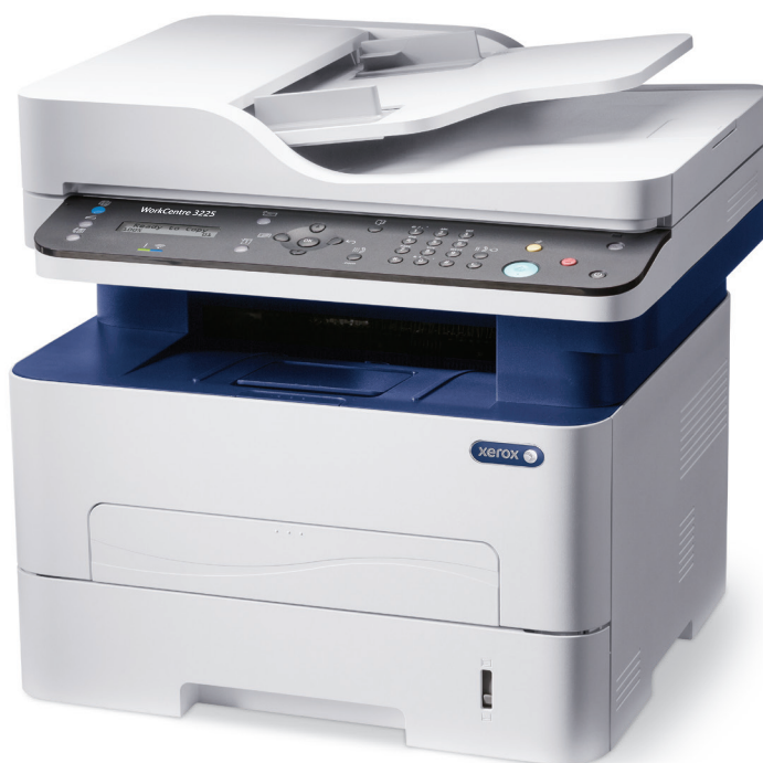
WorkCentre 3215/3225. Copy. Print. Scan. Fax. Email.