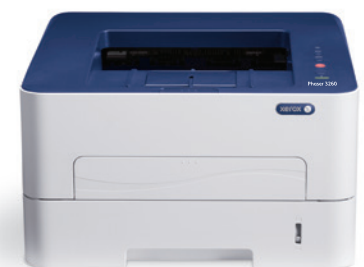
Phaser 3260. Print.