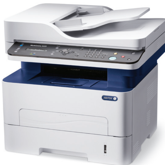
WorkCentre 3215/3225. Copy. Print. Scan. Fax. Email.