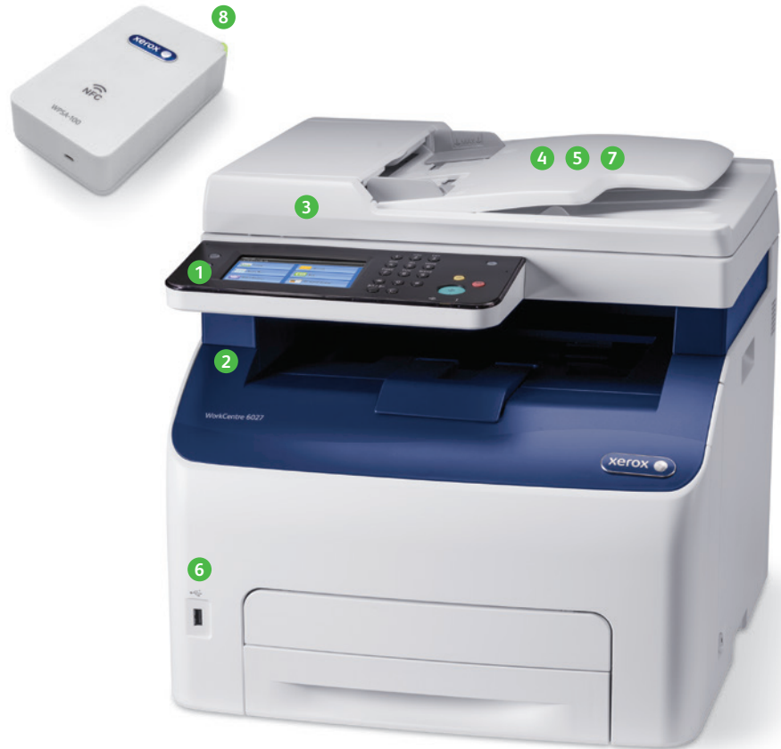
WorkCentre 6027. Copy. Print. Scan. Fax. Email.