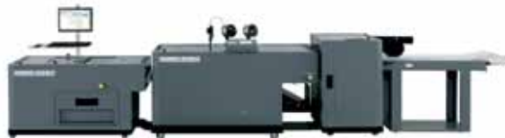
Duplo DBM-5001 Inline Booklet Maker