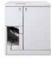
Xerox® Tape Binder