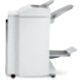
High Volume Finisher with Booklet Maker