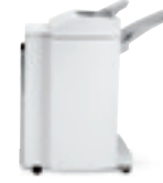
High Volume Finisher