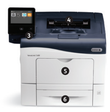
Xerox<sup>®</sup> VersaLink<sup>®</sup> C400 Color Printer Print.