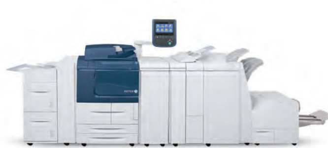
Xerox® D136 Copier/Printer shown with optional 2-Tray High-Capacity Feeder, Standard Finisher, Folder and Post Process Inserter.

Innovative production solutions to ensure a greener today and tomorrow.