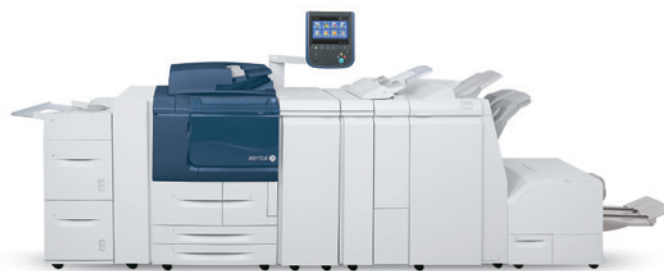
Xerox® D136 Copier/Printer shown with optional 2-Tray High-Capacity Feeder, Standard Finisher, Folder and Post Process Inserter.

Innovative production solutions to ensure a greener today and tomorrow.