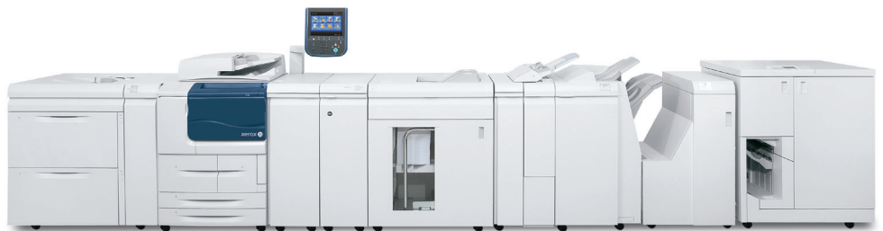
Xerox® D136 Copier/Printer shown with 2-Tray Oversized High-Capacity Feeder, GBC® AdvancedPunch™, High-Capacity Stacker, Standard Finisher Plus, Booklet Maker Finisher, Post Process Inserter and Tape Binder.