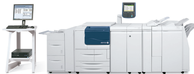
Xerox® D136 Printer shown with optional High-Capacity Feeder, GBC AdvancedPunch, Standard Finisher, Folder and Post Process Inserter.

Innovative production solutions to ensure a greener today and tomorrow.