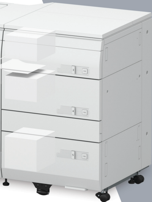
imagePRESS V1000 shown with optional accessories.