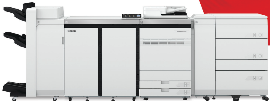
imagePRESS V1000 shown with optional accessories.