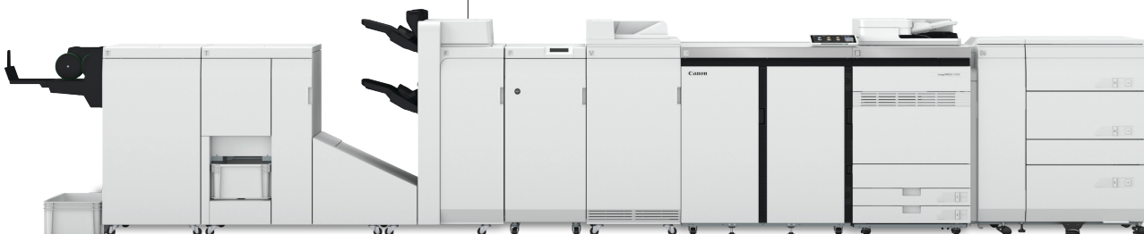
imagePRESS V1000 shown with optional accessories.